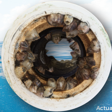
Actual Photos from '72' Yacht